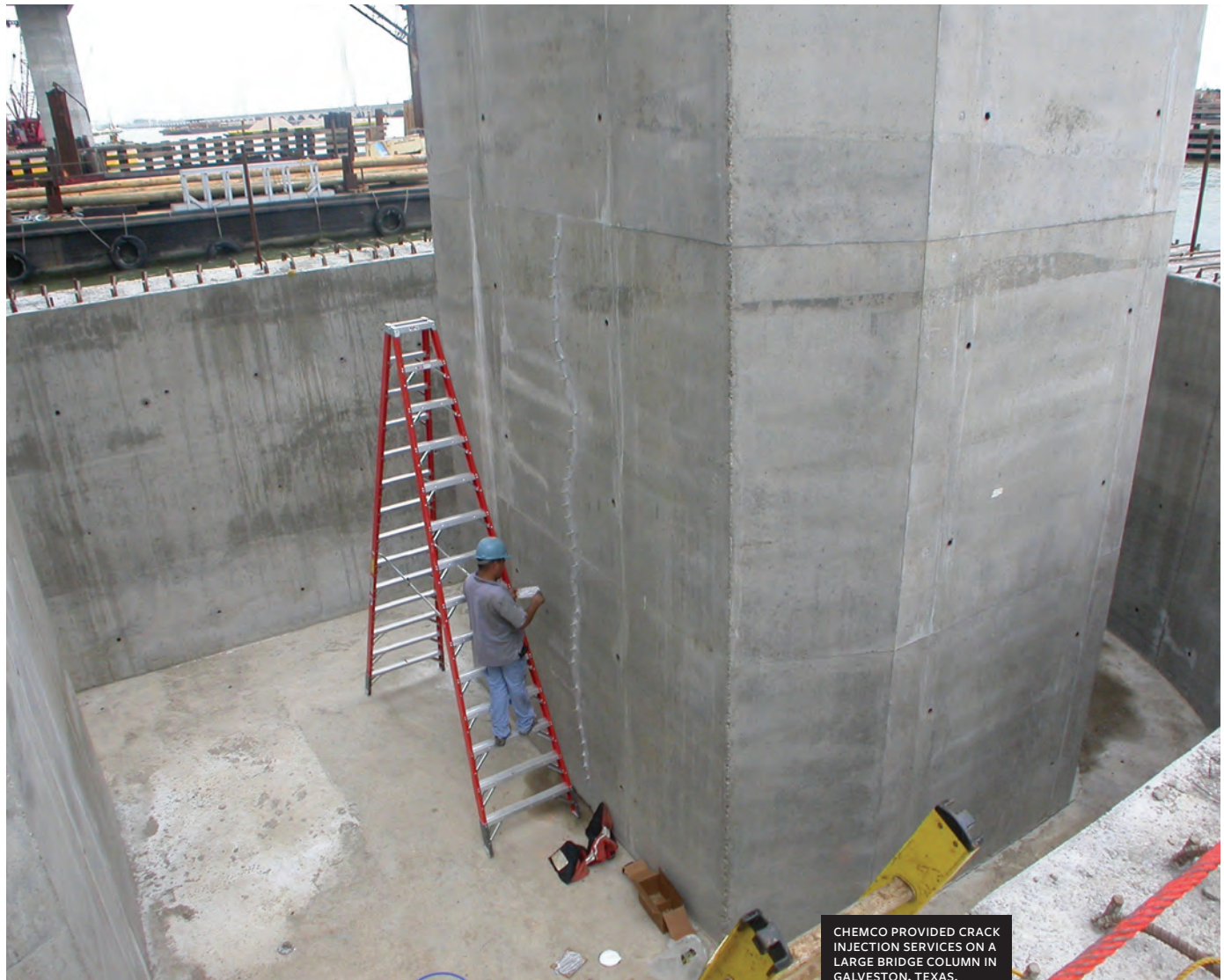
CHEMCO PROVIDED CRACK INJECTION SERVICES ON A LARGE BRIDGE COLUMN IN GALVESTON, TEXAS.